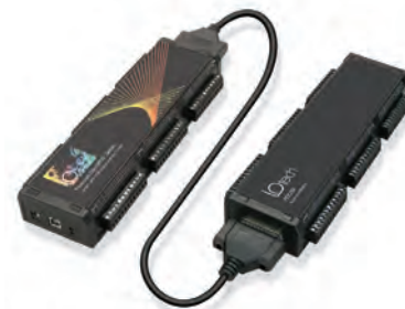
Personal Daq/3000 attached to a PDQ30 expansion module via a CA-96A cable

Unique to the Personal Daq/3000 Series is a low-latency, highly deterministic control output mode that operates independent of the PC. In this mode digital, analog, and timer outputs can respond to analog, digital, and counter inputs as fast as 2 \mu s; at least 1,000 times faster than other products that rely on the PC for decision making.