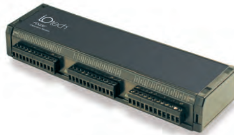
PDQ30, analog input expansion module