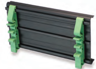
PDQ10, DIN-rail mounting adapter