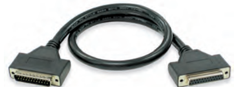
CA-96A, Personal Daq/3000 to PDQ30 cable

Note: For OEM and embedded applications, see DaqBoard/3000 USB.