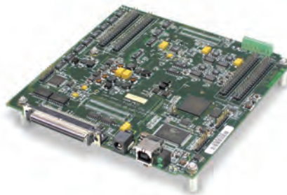
DaqBoard/3000USB, 16-bit/1-MHz USB data acquisition board