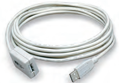
PDQ12, USB-powered extender cable